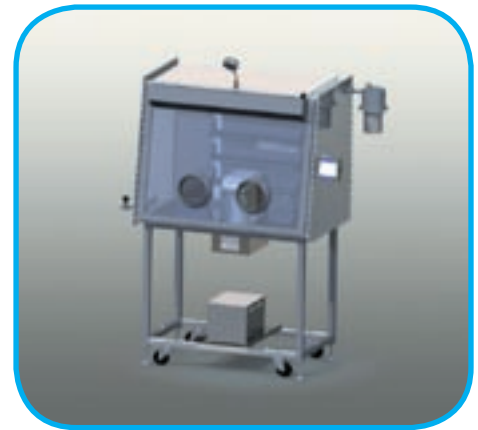
Q150GB mounted in a glove box

At the operational heart of Q150GB is a simple colour touch screen, which allows even the most inexperienced or occasional operators to rapidly enter and store their own process data. To further aid ease of use a number of typical sputtering and evaporation profiles are provided.