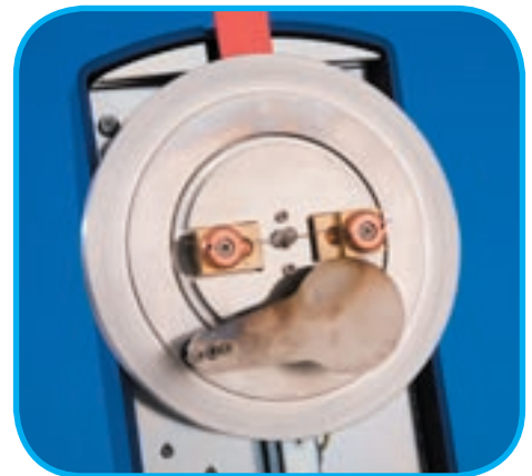
Metal evaporation head